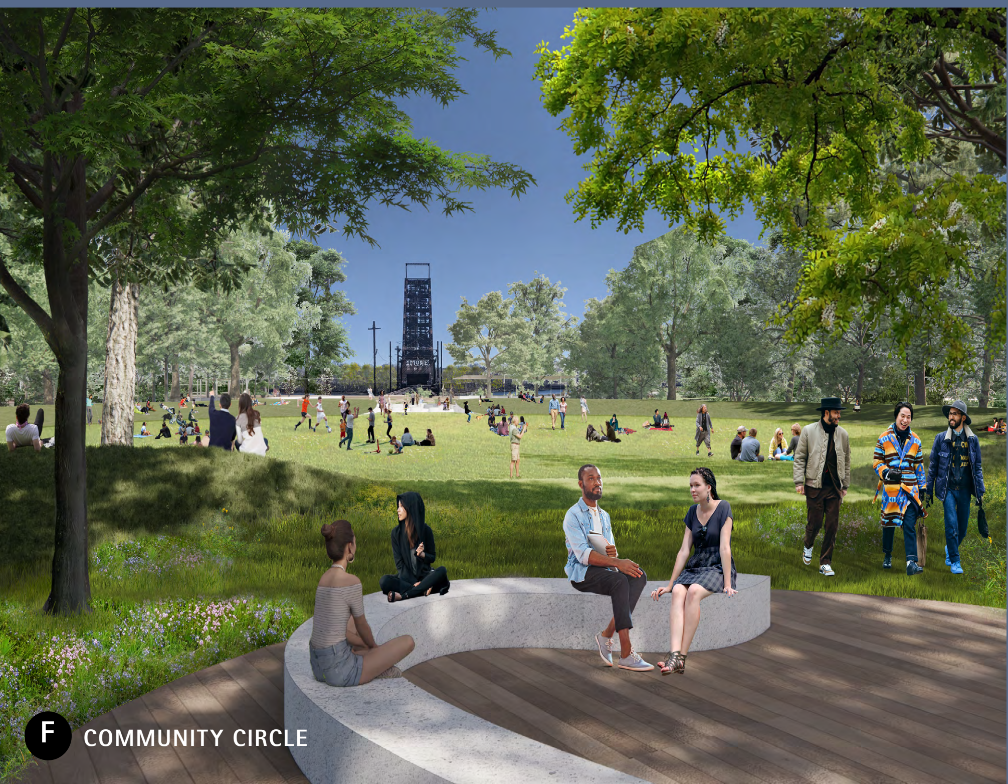
F COMMUNITY CIRCLE