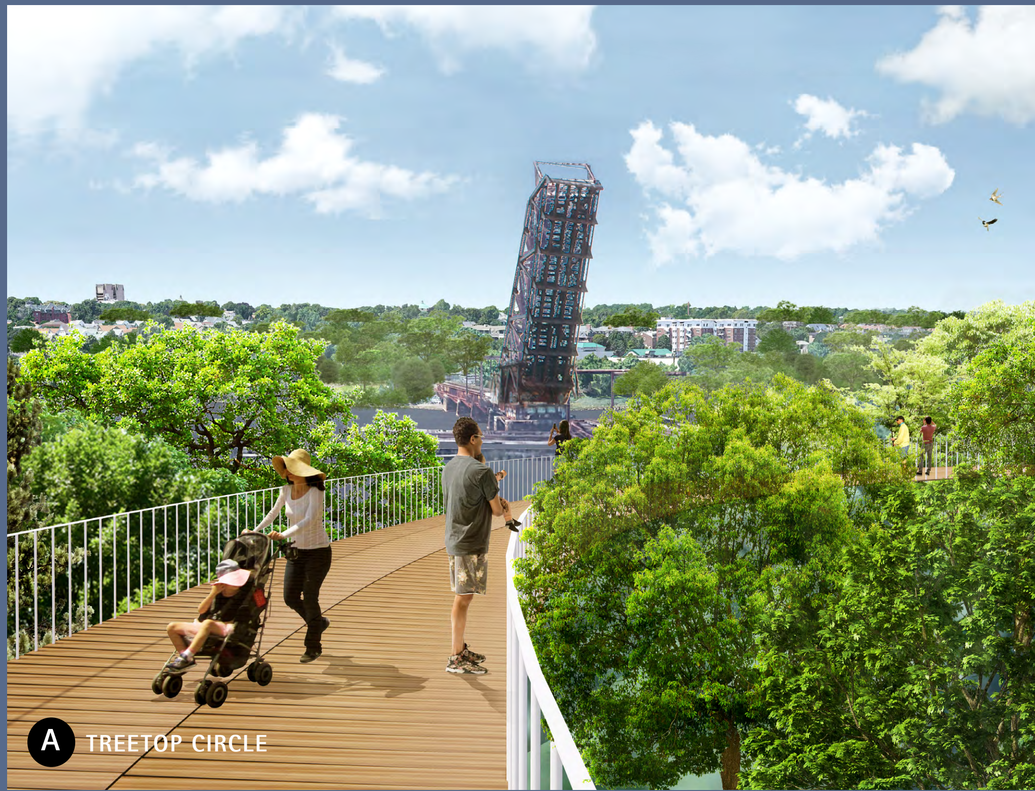
A TREETOP CIRCLE

We recognize that this proposal seeks to frame this project as an integral part of a larger environment and we have suggested a means to implement its design in phases that would allow for building the public interest, align project goals with existing historic, environmental and educational coalitions and, most importantly, bring together local community and municipal participation in realizing the vision.