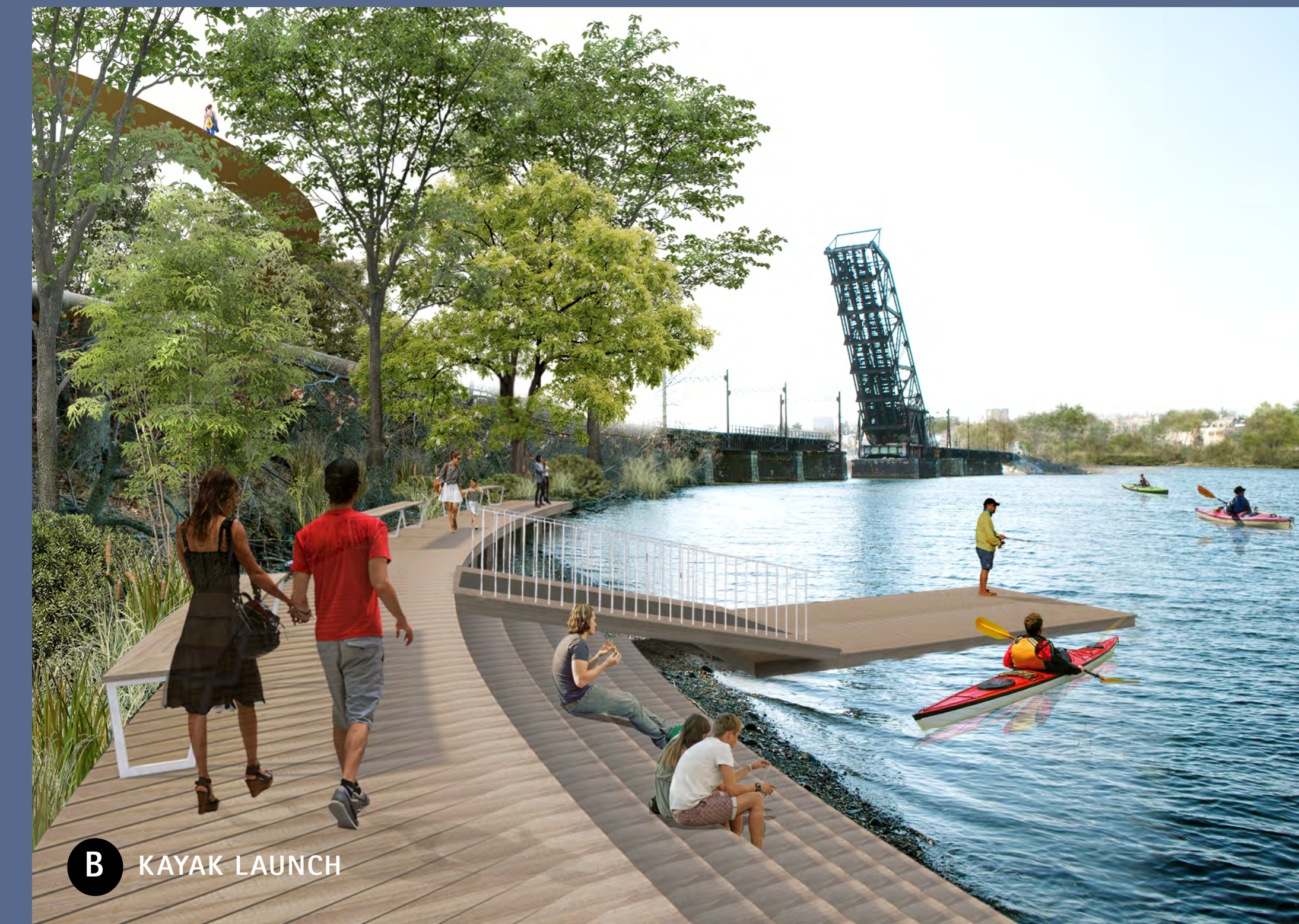
B KAYAK LAUNCH