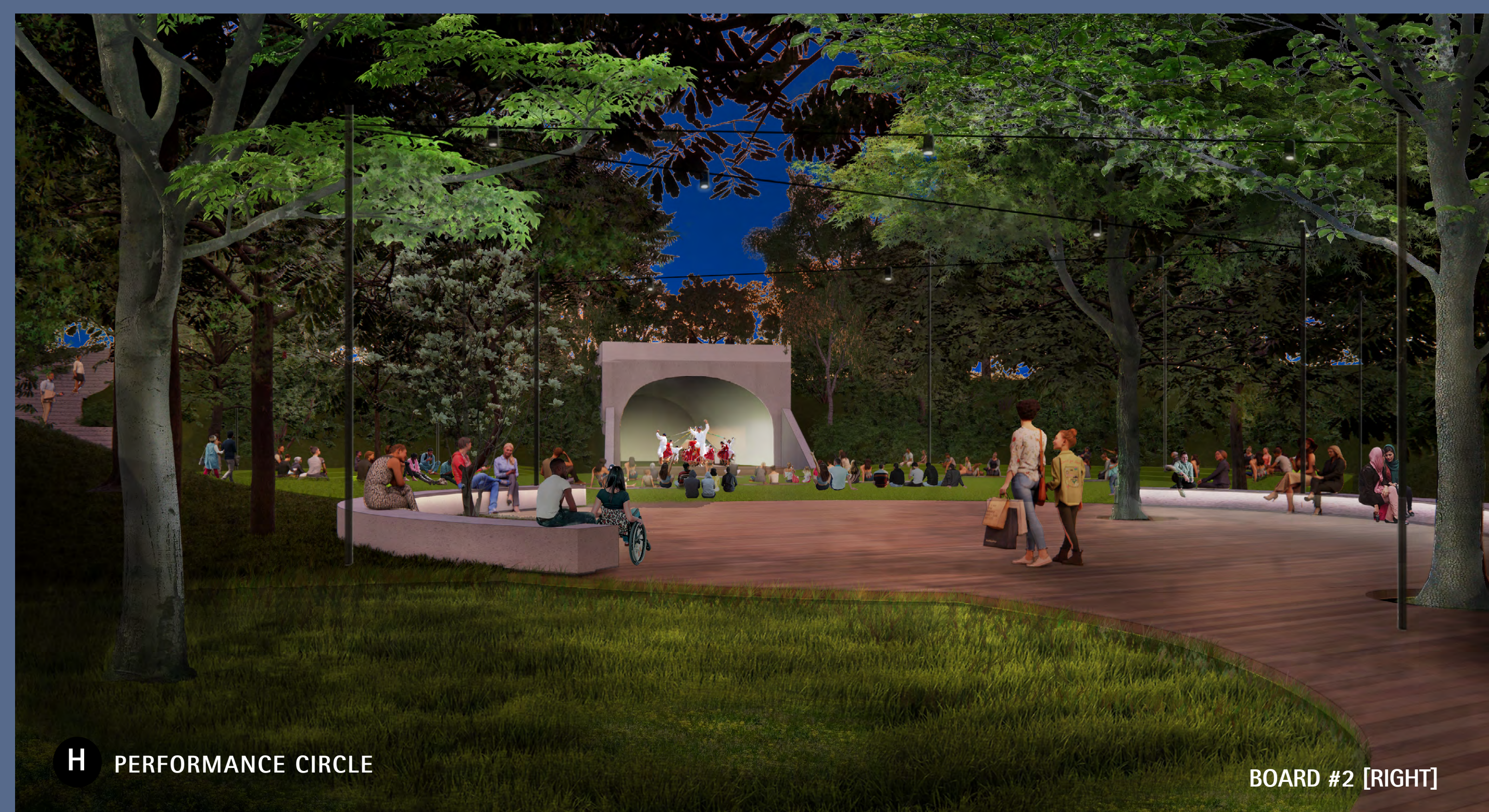
H PERFORMANCE CIRCLE