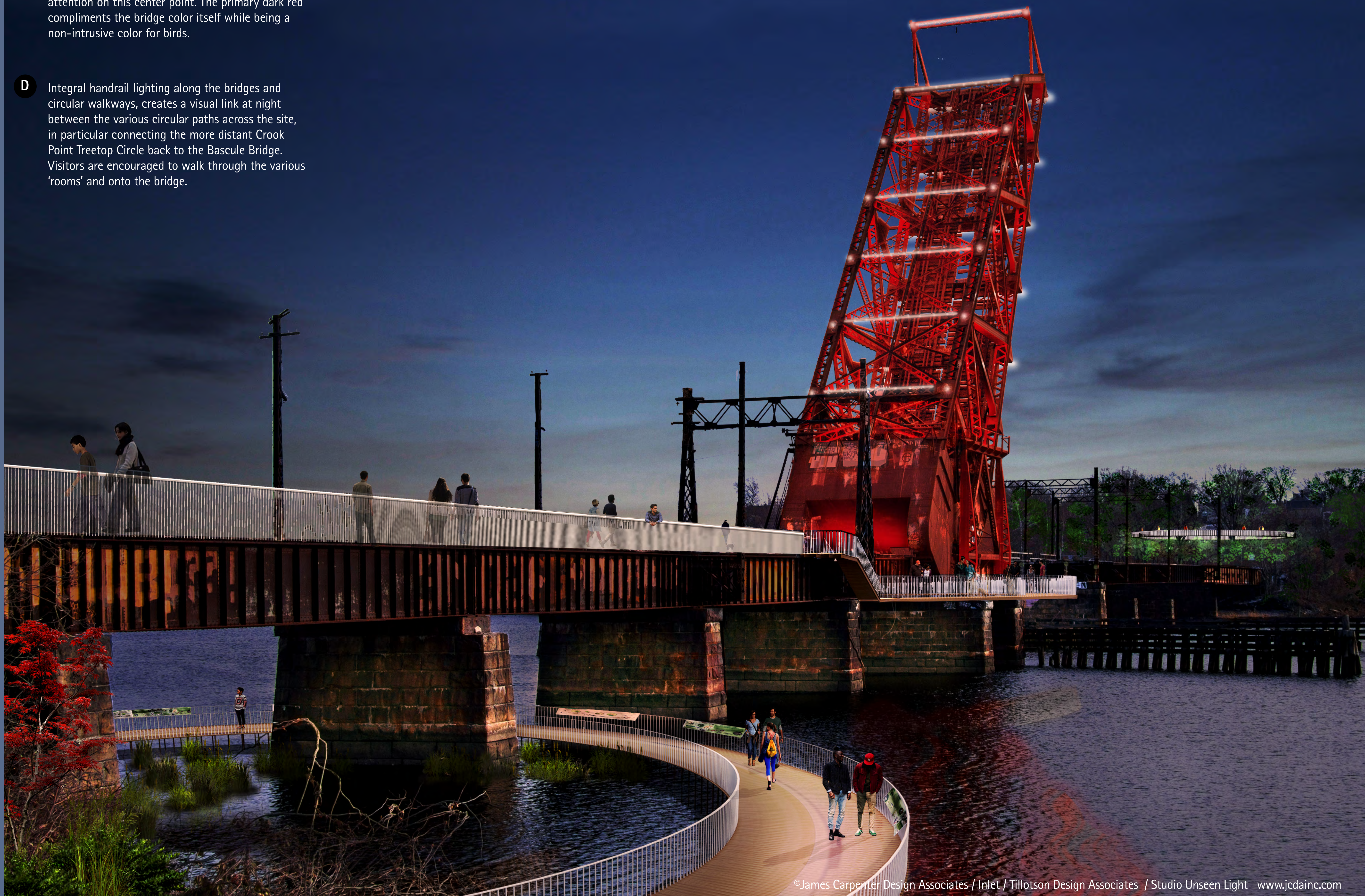
©James Carpenter Design Associates / Inlet / Tillotson Design Associates / Studio Unseen Light www.jcdaine.com