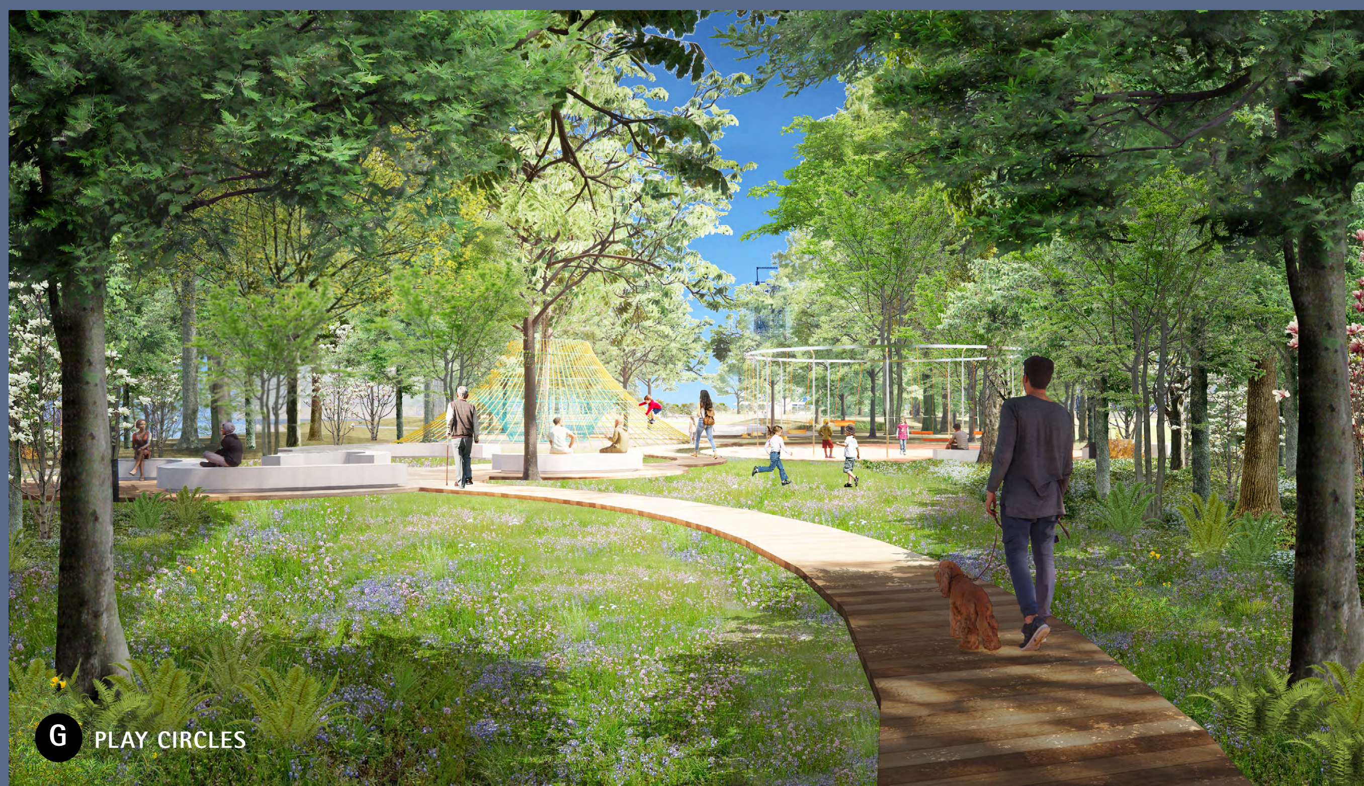
G PLAY CIRCLES