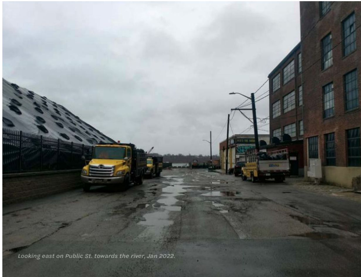
Looking east on Public St. towards the river, Jan 2022.

The Public Street project will transform this waterfront area to prioritize community wellness, and acknowledge climate risk and environmental conditions in alignment with the City of Providence's Climate Justice Plan.