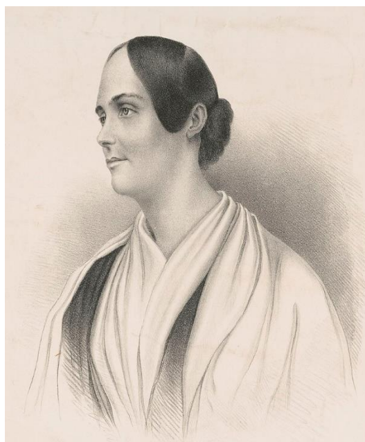
Abby Kelley, circa 1846.

After this rupture, whenever the Society held a meeting, the Suffrage Association supporters would crash it. On December 13, 1841, the Providence Daily Journal reported a disruption at an anti-slavery meeting at the Town House 29 in Providence by a “number of rowdy boys,” in which “Abby [Kelley] was full of spunk and did not care a fig for the noise, but told them to make as much disturbance as they please.” 30