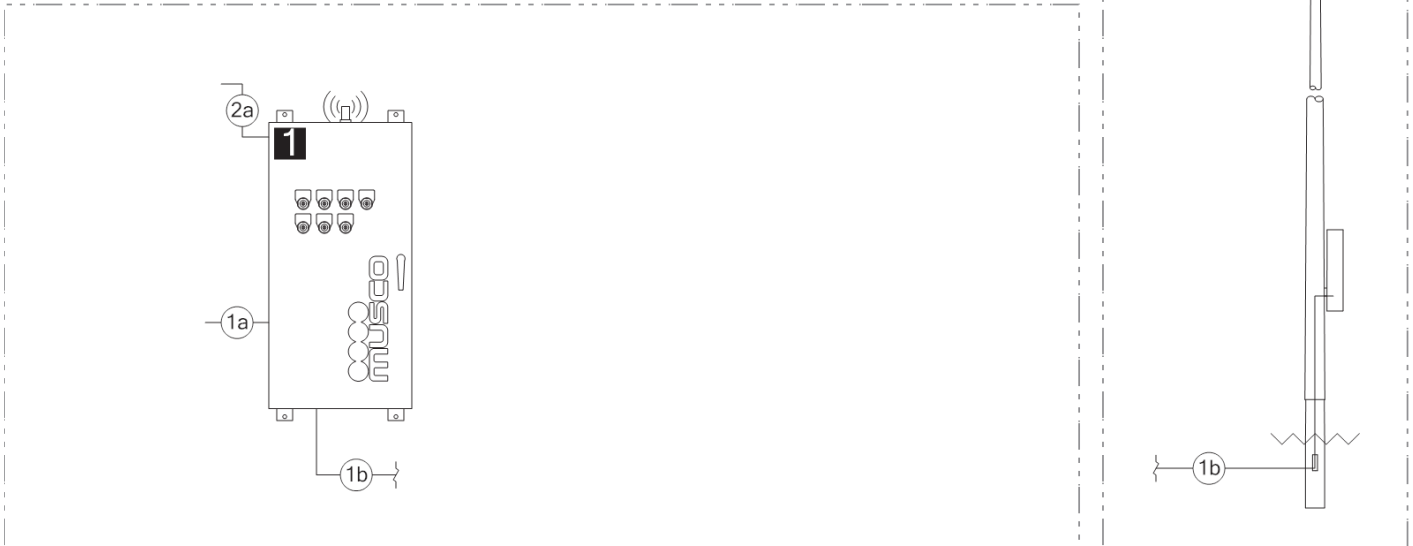
Control cabinet location(s)