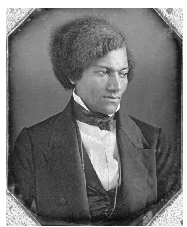
Frederick Douglass, circa 1848.

According to Douglass, African Americans in Rhode Island were not for Dorr nor Law and Order, but for a "constitution free from the narrow, selfish, and senseless limitation of the word white." He says that Dorr was "a well-meaning man" with "progressive views" but "shared the fate of all compromisers and trimmers, for he was disastrously defeated." Dorr's demise was partly tied to his failure to muster his party's support for Black suffrage. The Law and Order Party took on this charge mainly because it recognized the collective