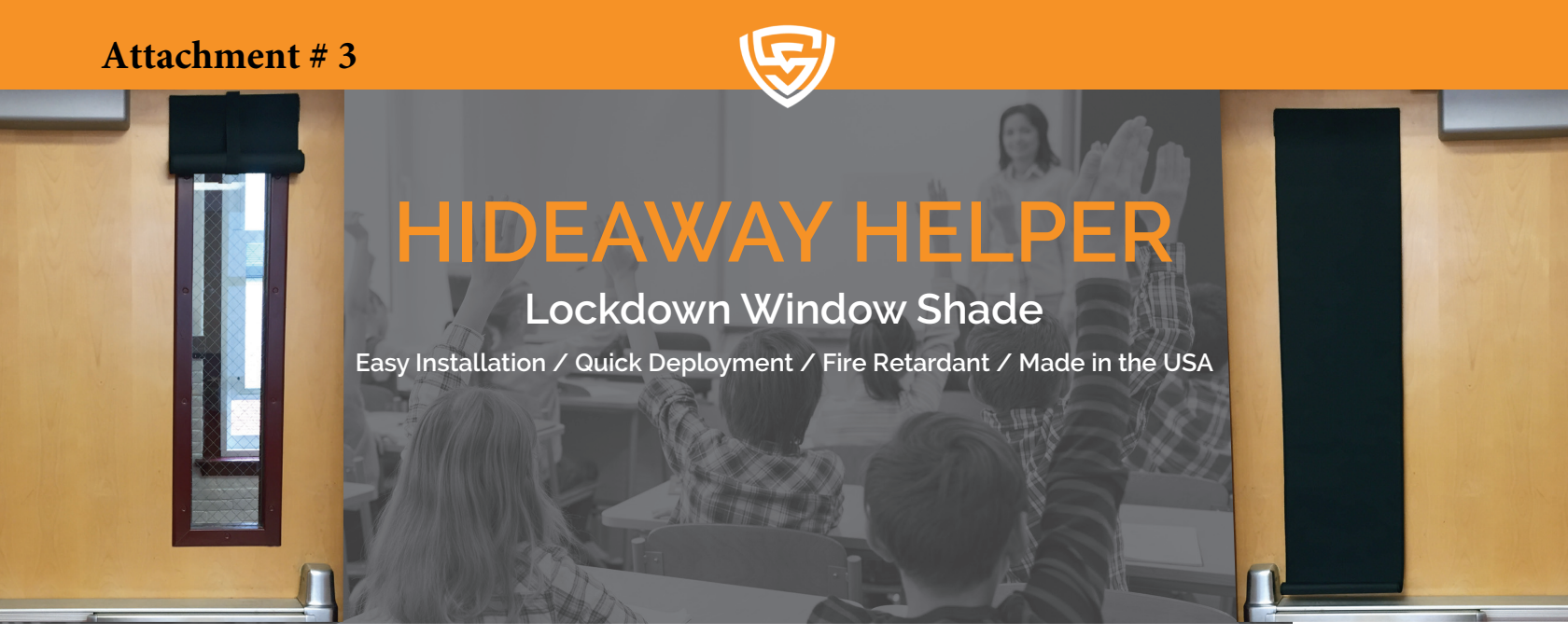
Hideaway Helper in rolled up position